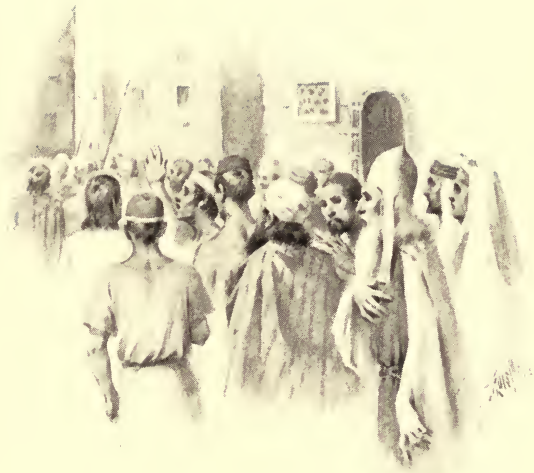
"THE OLD MAN FOLLOWED THE MULTITUDE"